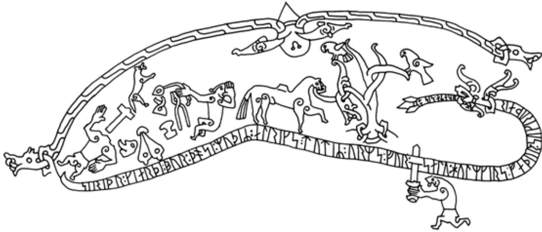
Figure Error! No text of specified style in document..1. The Ramsund Runestone, Sweden. This large carving on the flat side of a sloping rock outcrop portrays the tale of Sigurðr Fafnisbani, the slayer or bane ( bani ) of the dragon Fafnir.

Sample Second Quarter Course in Old Norse. Please feel free to change or alter as you see fit. This course, as it is arranged, is the second of a two semester course series. If one wishes to have just a single quarter, please alter to include more lessons.